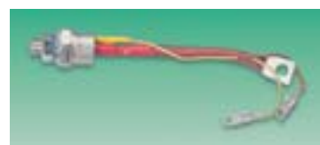
TO-93 (3/4" 16-UNF 2A) TO-118 (3/4" 16-UNF 2A) TO-94 (1/2" 20-UNF 2A)

B-PUK: H=27.0, Dia=58.5 (excl. tab) E-PUK: H=15.1, Dia=42 (excl. tab) K-PUK: H=27.5, Dia=74.5 (excl. tab)